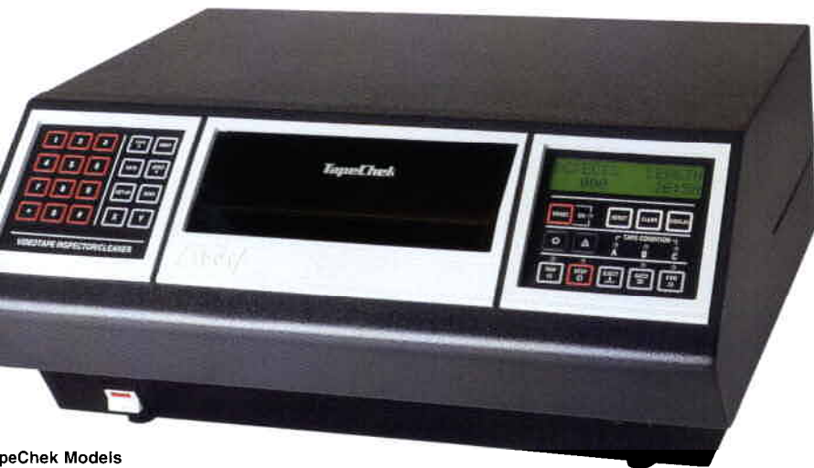
TapeChek Models Accommodate Both VHS & S-VHS Tapes

Status display. Machine diagnostics, setup displays, warnings and other informational messages